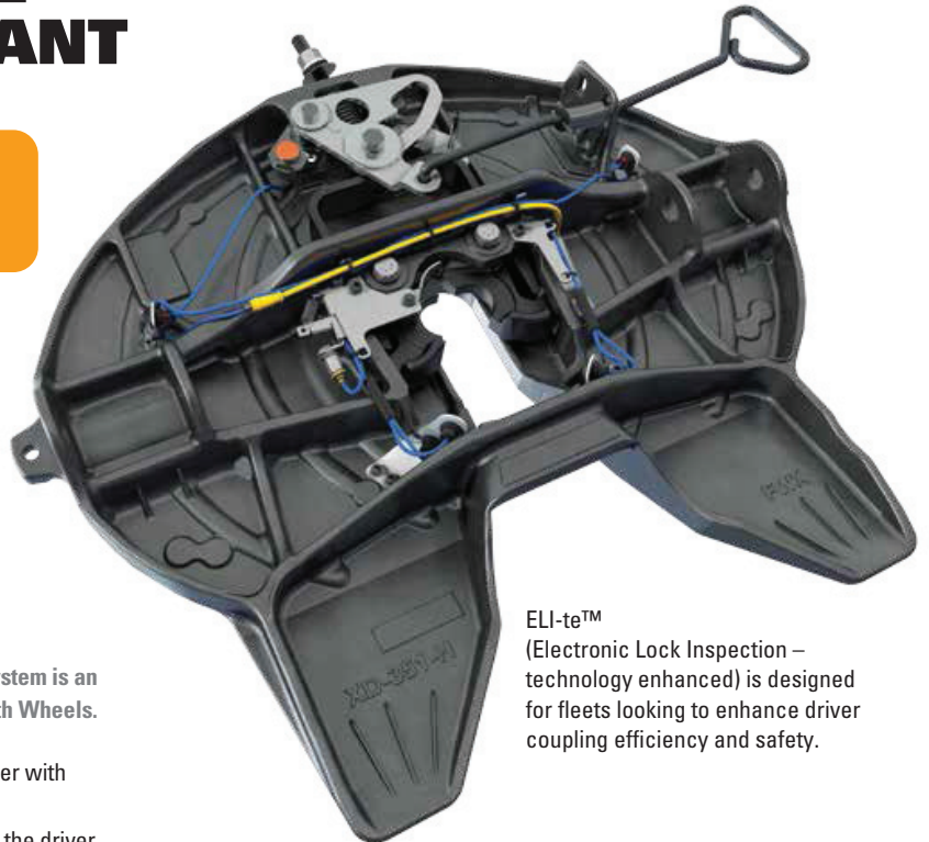
ELI-te™ (Electronic Lock Inspection – technology enhanced) is designed for fleets looking to enhance driver coupling efficiency and safety.