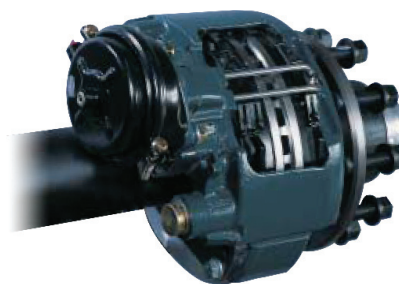
Shown with WABCO PAN19-1 Caliper